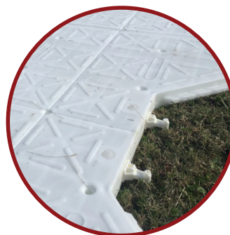
QUICK AND EASY INSTALL CONNECTORS