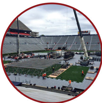
UNIQUE MODULAR FITTING