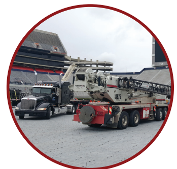
EXTREME STRENGTH- TO-WEIGHT RATIO